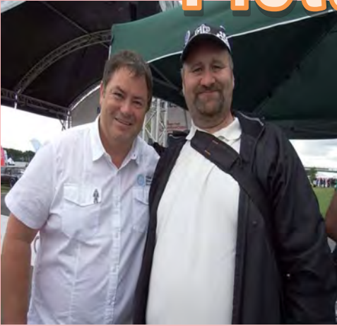
some famous and some not so famous