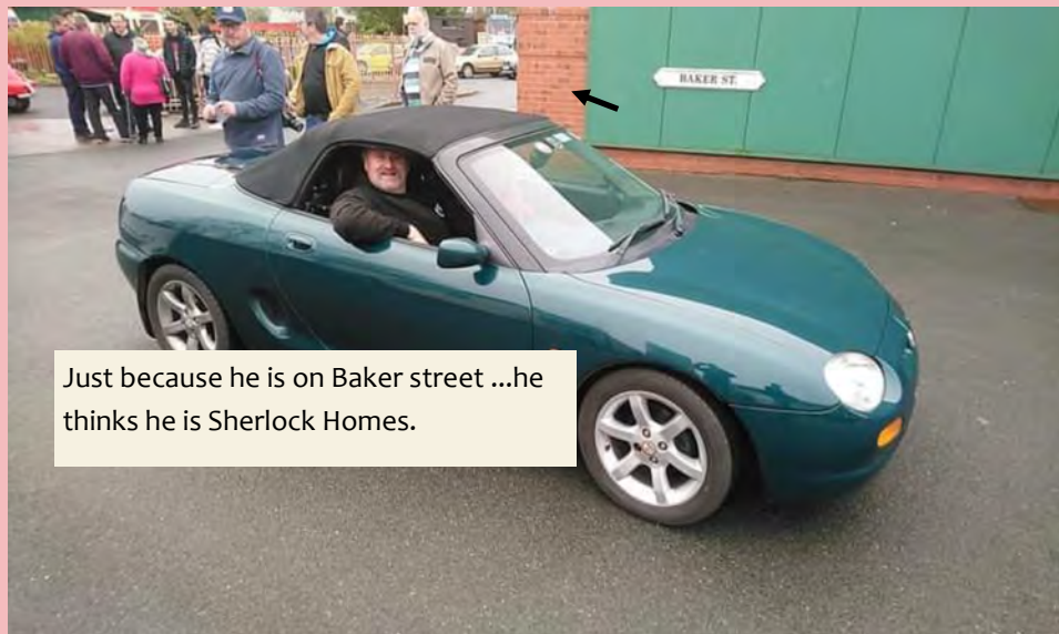
Just because he is on Baker street ...he thinks he is Sherlock Homes.

If you have any photos you would like to see and share ,please send them in to me.